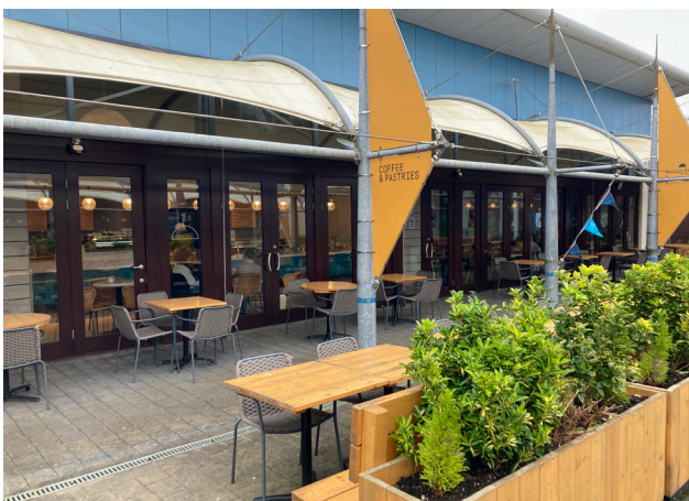
The Cornish Bakery

There are two eateries at Affinity Devon Outlet Shopping Centre - The Cornish Bakery and Costa. Both have indoor and outdoor seating.